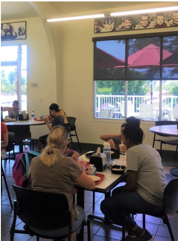
Eating lunch daily in the dining hall helps students learn social skills, manage sensory processing challenges and build the foundation for community inclusion.