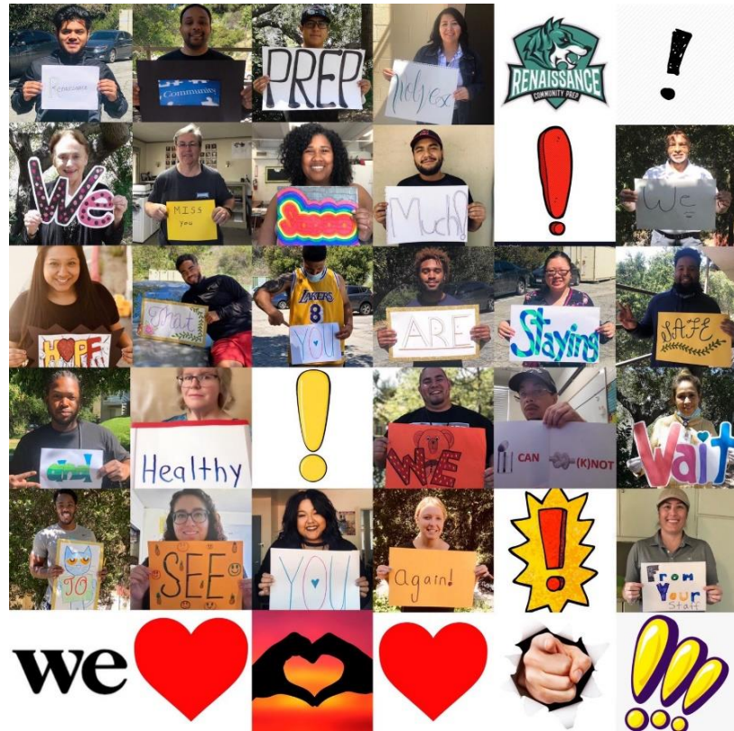
The Renaissance Team