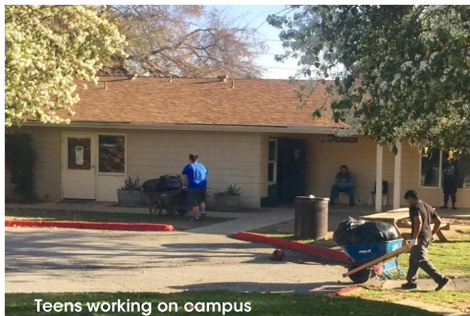
Teens working on campus