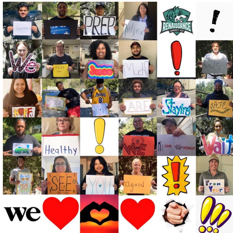
The Renaissance Team