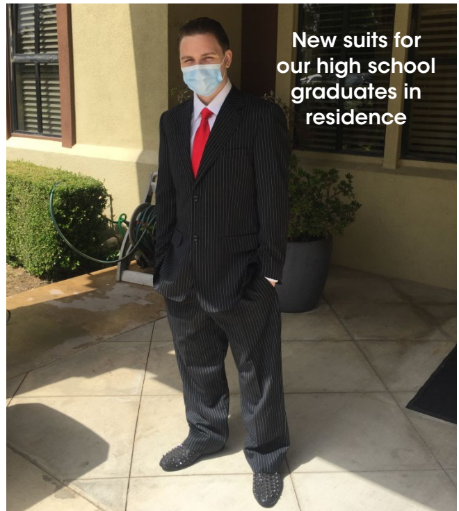
New suits for our high school graduates in residence