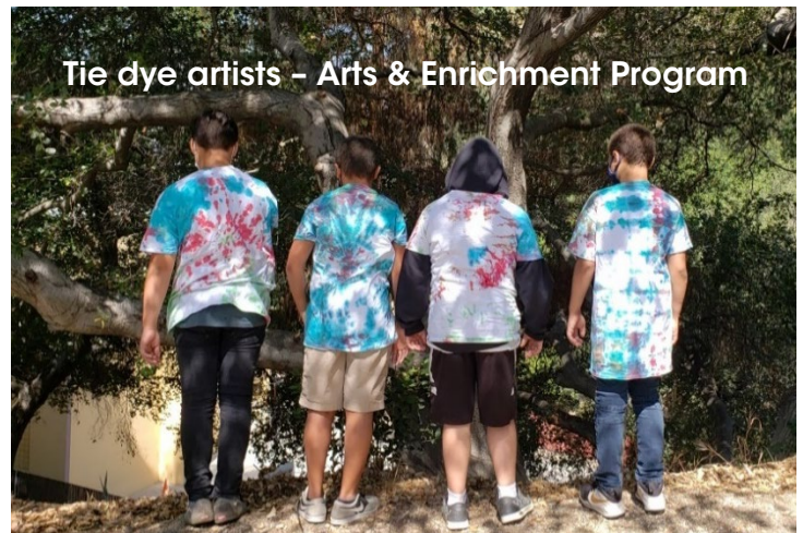
Tie dye artists – Arts & Enrichment Program