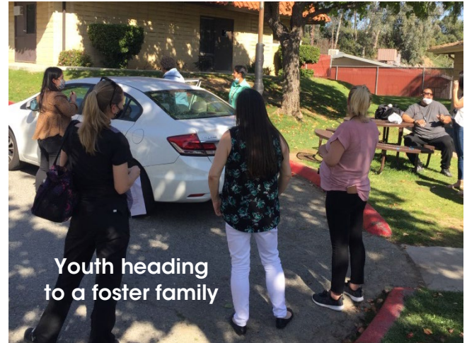
Youth heading to a foster family