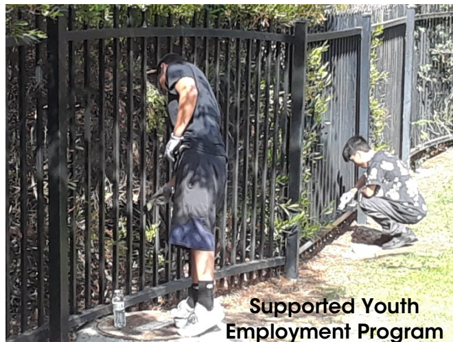
Supported Youth Employment Program