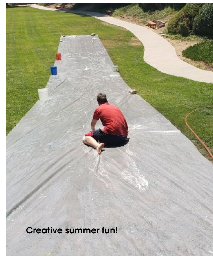
Creative summer fun!